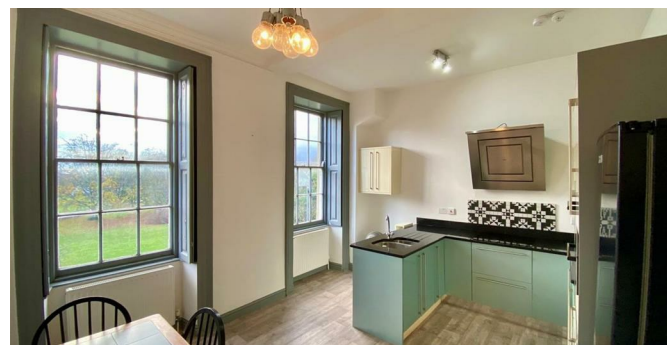
Frenchay Park House Beckspool Road Frenchay BS16 1YB